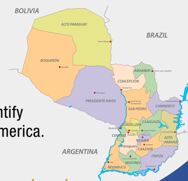
Paraguay Map by Departments